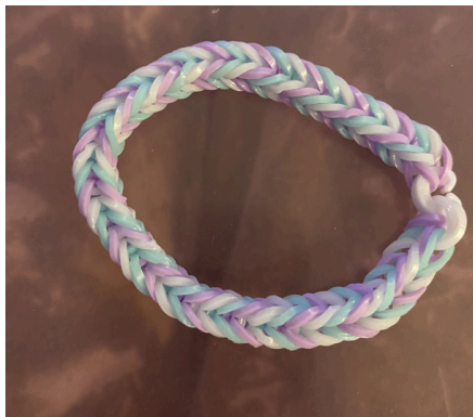
Fishtail Bracelet Pattern